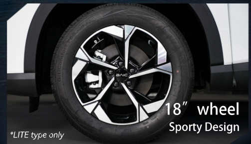
18" wheel Sporty Design *LITE type only