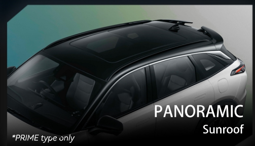
PANORAMIC Sunroof *PRIME type only