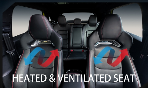
HEATED & VENTILATED SEAT